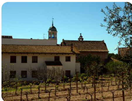
Centro de Interpretación de la Malvasia de Sitges