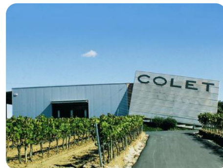
Colet Clàssic Penedès