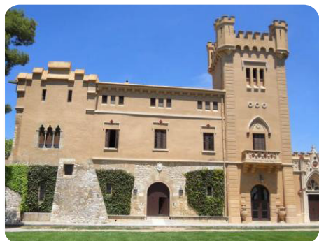
Bodegas Torre del Veguer

The stop in Sitges has the added value of being able to taste Malvasia de Sitges (Sitges Malvasia wine), a gastronomic, historical and cultural legacy, whose scope, uniqueness and expansion will be explained to you (tasting included) at the Centre d'Interpretació de la Malvasia (CIM, Malvasia Interpretation Centre) of the Celler de l'Hospital (the Hospital's Winery).